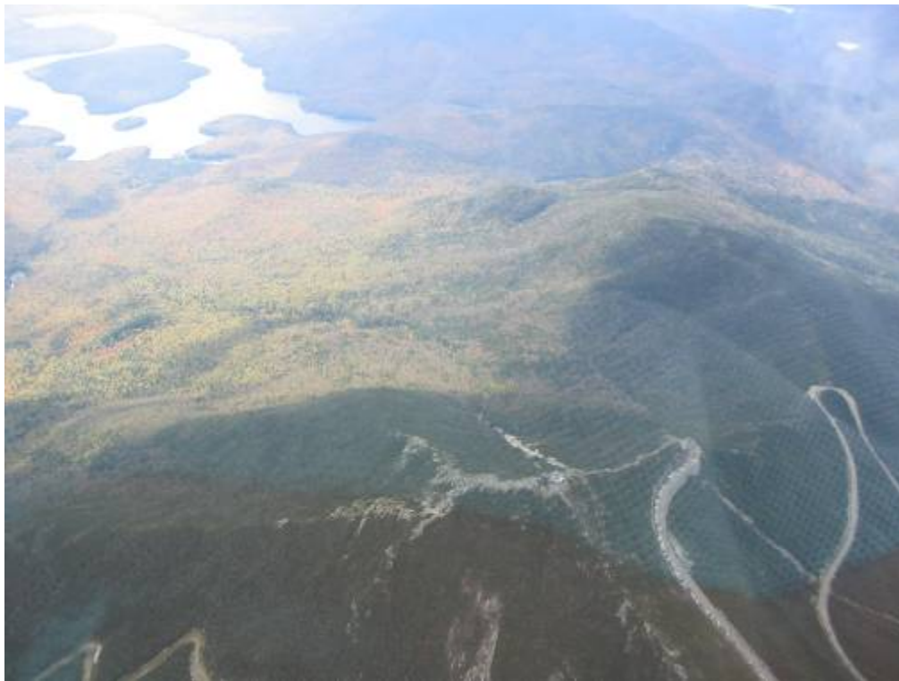
Whiteface Mountain & Lake Placid