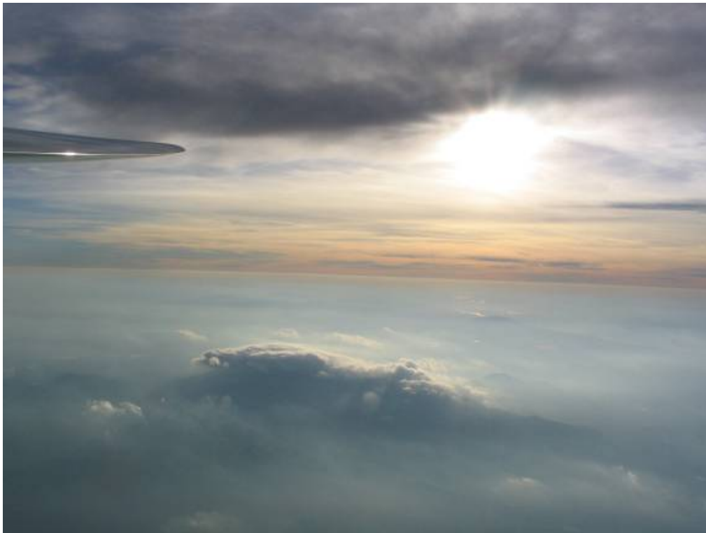
12000 ft and Climbing – Oct. 05 Lake Placid

MSC is packing up a tow plane and their Twin Astir and heading to Lake Placid (LP) on the 23 rd of Sept. They will be flying on weekends through to the end of October. A clean room at Shultie’s motel near the airport goes for about $55 US/night or you can camp at the airport. If you are interested in attending please see Ulli, Nick or myself for more information and so that we can brief you on flying operations at LP. This briefing is a must for any pilots that are new to the LP area as the terrain in and around the airport is very unforgiving. Pilots wishing to fly solo at LP must also be Bronze C and/or XC approved.