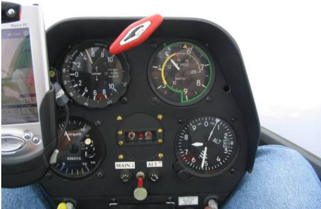
7500ft & Still Climbing!!!