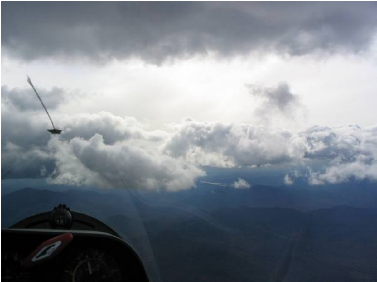
Over the Sawtooth Mountains

Although I wasn't at GGC this past weekend, it sounds like the flight line was quite busy on Saturday. It's amazing what and who you can hear at 7000 ft over the Adirondacks. Tim, Doug, Ulli, Martin, and even QIH calling the Pendleton circuit! Conditions in Lake Placid were superb for thermals as the 5-8 kt winds were too low for any measurable wave generation. A few photos from Saturday are shown below.